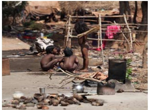
Children living and playing in a rubbish dump

Poverty is hunger. Poverty is losing a child to illness caused by lack of sanitation and dirty water. Poverty is lack of shelter. Poverty is being sick and not being able to see a doctor. Poverty is not having access to school and not knowing how to read. Poverty is not having a job. Poverty is fear for the future. Poverty is living one day at a time. Poverty is powerlessness. Poverty is lack of representation and freedom.