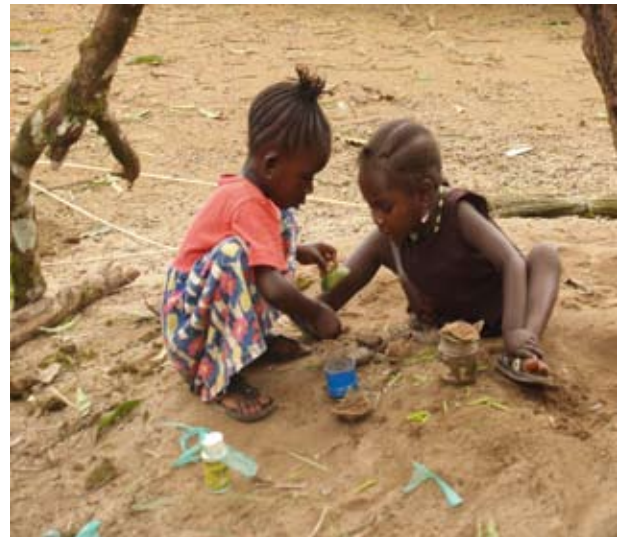
Children deserve a life and a future